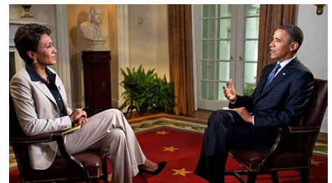
History making ABC News interview with President Barack Obama on May 9th.

As a result of this potentially divisive announcement, we as Democrats will have to re-double our efforts both financially and persuasively to make certain that this truly progressive President is re-elected in November. FORWARD, not backward - Let's get busy !